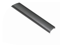
Black clear (PC)