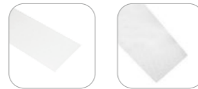
PC Cover (optionally)