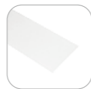
PC Cover (optionally)