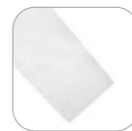
Anti-glare prism diffusion plate (optionally)