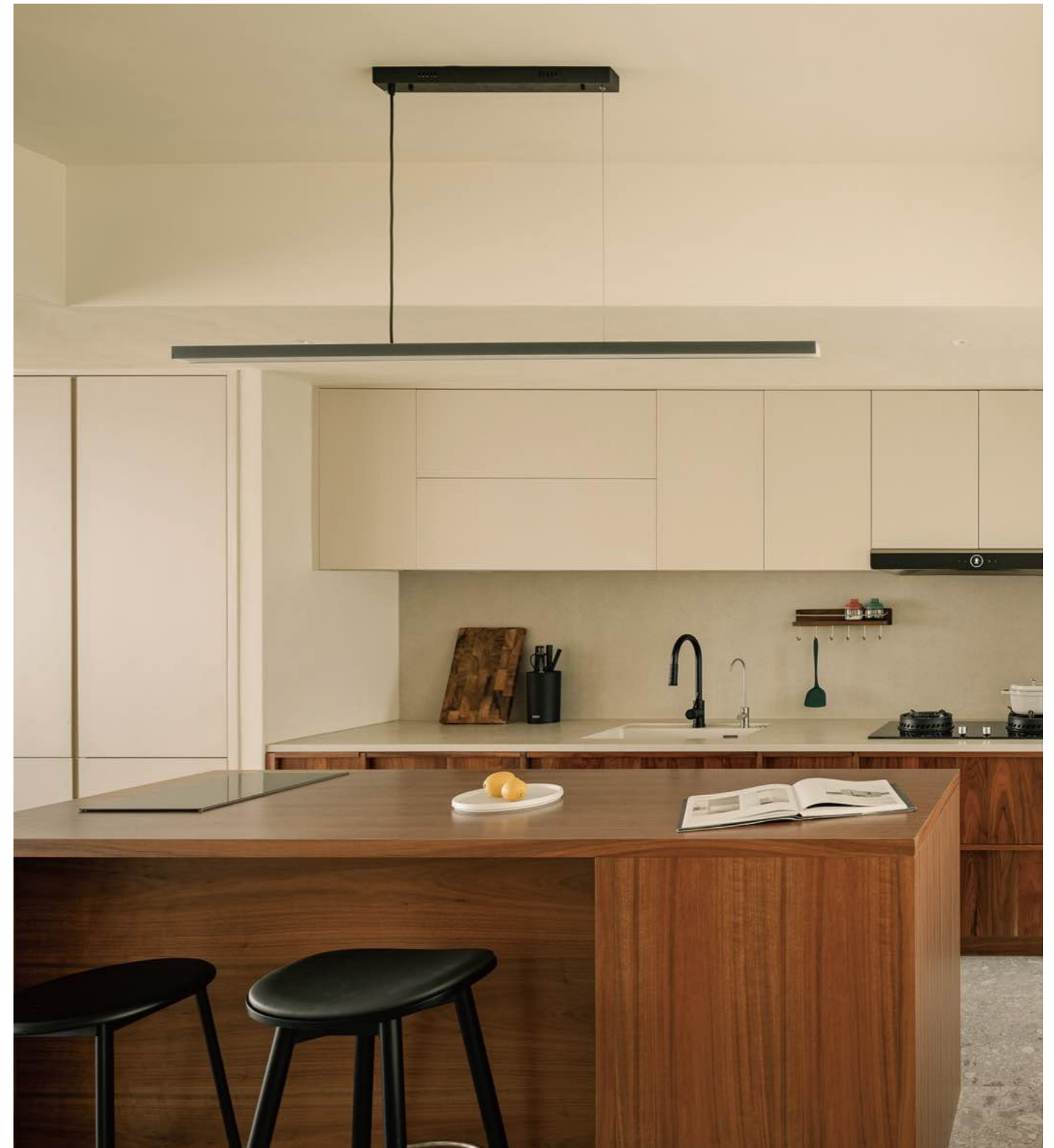
Anti-glare prism diffusion plate (optionally)